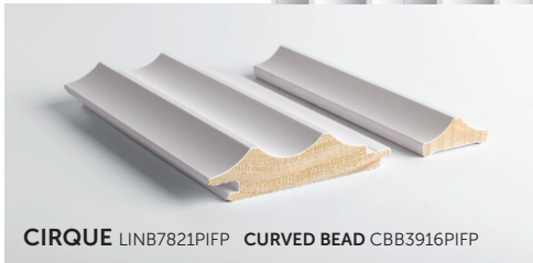
CIRQUE LINB7821PIFP CURVED BEAD CBB3916PIFP