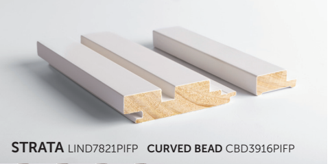
STRATA LIND7821PIFP CURVED BEAD CBD3916PIFP

Inspired by crevices across the Macedon Ranges in Central Victoria, Primed Pine Contours in Strata are enhanced by its shadow gap for variation and interest.