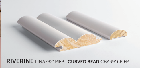
RIVERINE LINA7821PIFP CURVED BEAD CBA3916PIFP

Inspired by the Blue Lake in the Snowy Mountains region of New South Wales, Primed Pine Contours in Cirque soften strong lines and add richness to the material palette.