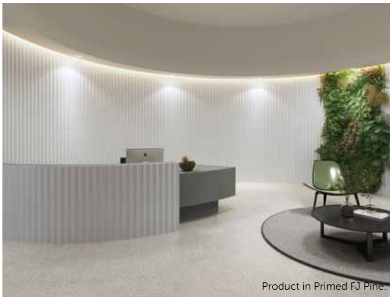
Product in Primed FJ Pine.

Inspired by the valleys between the sandstone bluffs and cliffs in Rainbow Valley, Northern Territory, Porta Contours in Valley envelope a space with gentle movement, tactile interest and natural warmth.