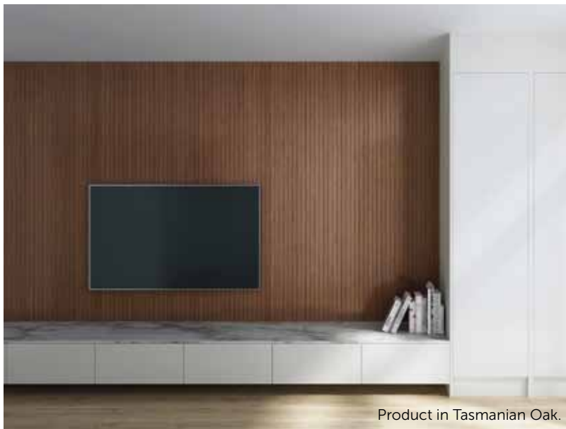
Product in Tasmanian Oak.

Inspired by the exposed rock layers at the Painted Cliffs on Maria Island, Tasmania, Porta Contours in Traverse invoke a sense of enveloping warmth and movement in interior spaces.