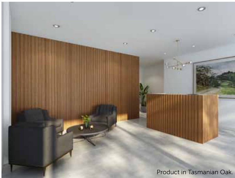
Product in Tasmanian Oak.

Inspired by Lake Eyre, South Australia, the lowest natural point in Australia, Porta Contours in Ayre layers texture to create variation and visual interest.