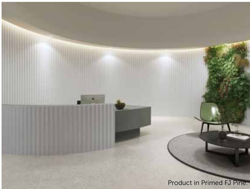
Product in Primed FJ Pine.

Inspired by the valleys between the sandstone bluffs and cliffs in Rainbow Valley, Northern Territory, Porta Contours in Valley envelope a space with gentle movement, tactile interest and natural warmth.