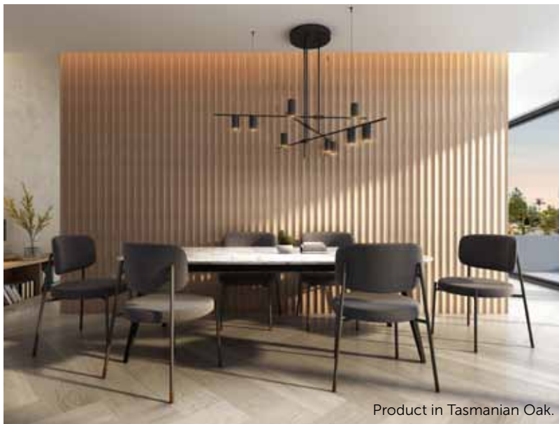
Product in Tasmanian Oak.

Inspired by the spectacular Hancock Gorge in Karijini, Western Australia, Porta Contours in Shade reflect the shadows cast into the depths of the valley below.