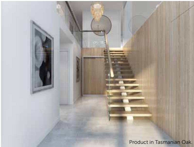
Product in Tasmanian Oak.

Inspired by the dramatic escarpment cliffs of the breathtaking Kakadu, Northern Territory, Porta Contours in Ridges combines strong linear movement with the natural warmth of timber.