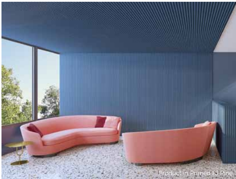
Product in Primed FJ Pine

Inspired by the Blue Lake in the Snowy Mountains Region of New South Wales, glacial cirques are formed at the head of a glacier when it pushes down a mountain and carves a semi-circle basin - later filling with water and forming a cirque lake.