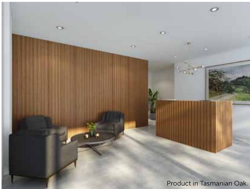
Product in Tasmanian Oak.

Inspired by Lake Eyre, South Australia, the lowest natural point in Australia, Porta Contours in Ayre layers texture to create variation and visual interest.