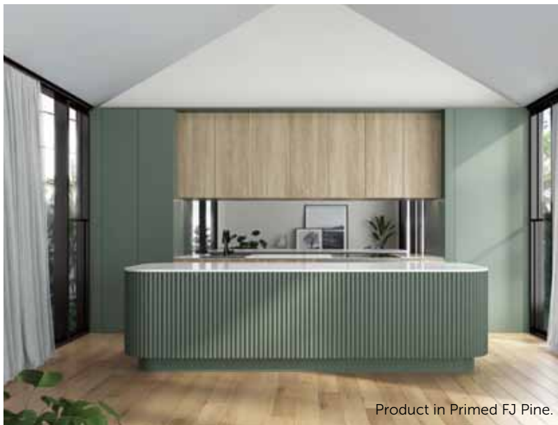
Product in Primed FJ Pine.

Inspired by the rolling mountains surrounding Ormiston Gorge in the Northern Territory, Porta Contours in Riverine add natural warmth, texture and movement to any room.