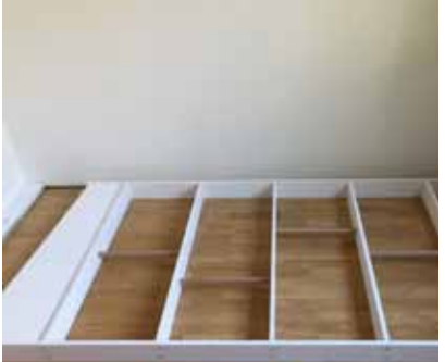
Step 8 - Build the shelf

NATASHA'S TIP: I cut the top of my dowel pieces at 10 degrees to fit my sloping ceiling.