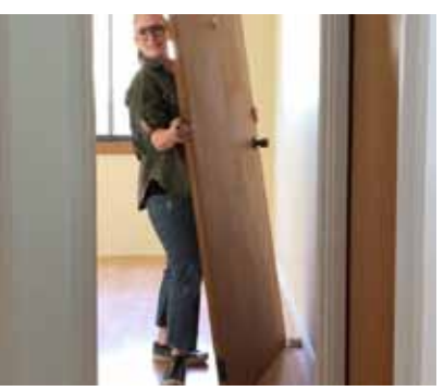
Step 1 - Remove the door

Use a drill to unscrew the hinges. removing the lower hinge first, so the door does not fall on you. If the hinges have been painted, score around the edges with a utility knife to help loosen them from the door jamb.