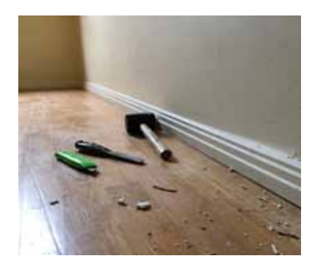
Step 2 - Remove door trim and skirting

Score along the join at the wall to prevent pulling off paint then tap a chisel or crowbar into the gap.